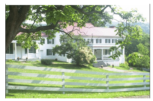
The Campbell "Mansion" as it is today. Tours are available.