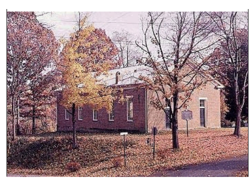
Historic Church Building at Bethany